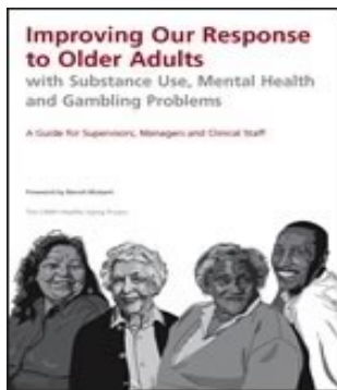
Improving Our Response to Older Adults