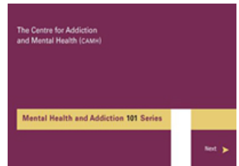
Mental Health & Addiction 101 Series (Section on Older Adults)